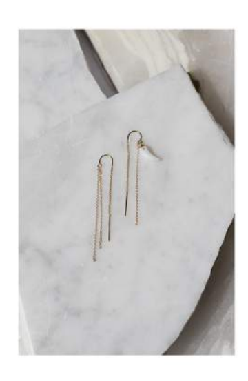
Talon Threader Earrings High-quality gold filled ear thread earrings with draping gold filled chains and one Czech glass talan.

Suggested Retail: $58.00 Wholesale: $29.00