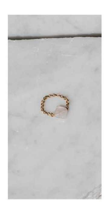
Rose Quartz Chain Ring

Angular semi-precious rose quartz stone on high-quality gold filled chain. Available in sizes 3 - 8.