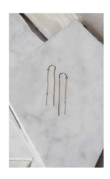
Threader Earrings Ear thread earrings with high-quality gold filled bars and chain.

Suggested Retail: $58.00 Wholesale: $29.00