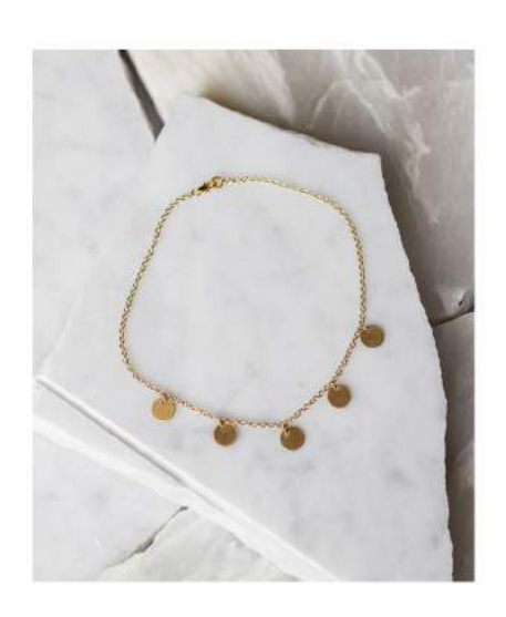
Gypsy Disc Choker

Brass disc drop pendants on high-quality gold filled chain with adjustable lobster close at back.