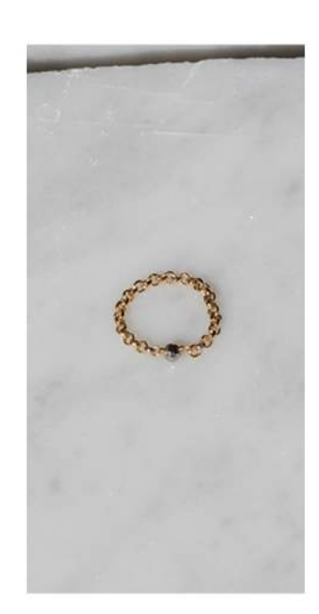
Hematite Chain Ring

Suggested Retail: $40.00 Wholesale: $20.00