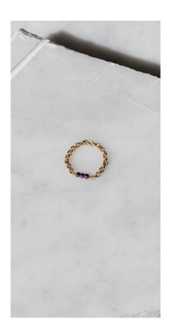
Lumi Chain Ring

Suggested Retail: $40.00 Wholesale: $20.00