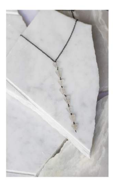
Arrow Tourmaline Drop Necklace

Clear arrow-shaped semi-precious tourmaline stones drop on black gunmetal chain with lobster close at back.