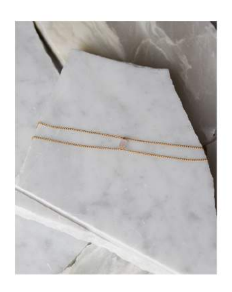
Rose Quartz Double Chain Choker

Suggested Retail: $55.00 Wholesale: $27.50